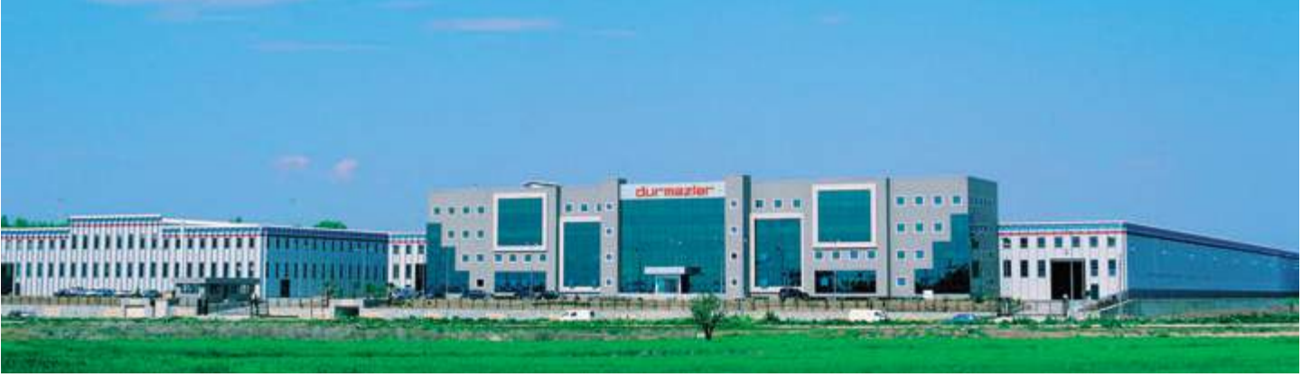
Head Quarter & Ataevler